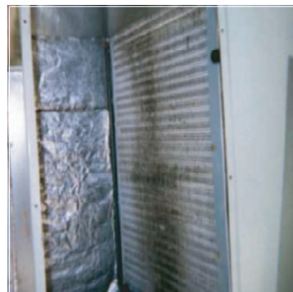
Picture of a dirty Heating & Air Conditioning System that needs cleaning.